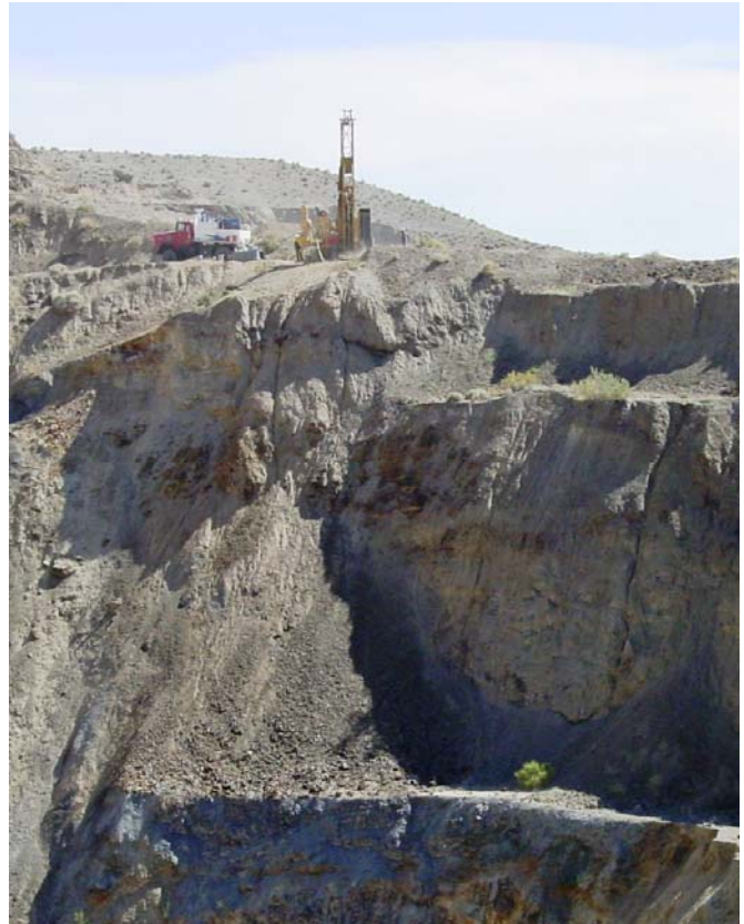
Firstgold Corp.'s reverse circulation drill rig in full operation in the existing pits.

Additionally, the company has acquired an additional drill rig (see page 3), which it expects to receive within 60 days. The deep rig is expected in December.