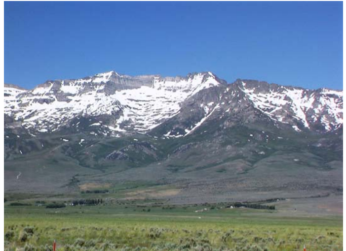
Antelope Peak after snow melt.

There should be more on this next month.