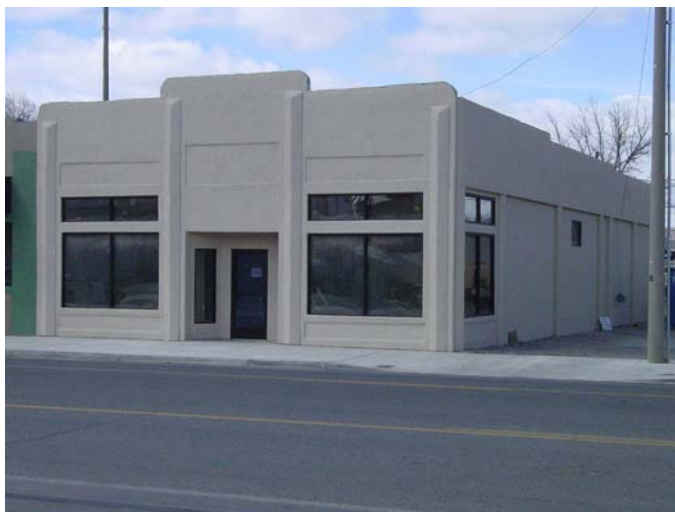
New stucco for Lovelock office provides "facelift" for local image.