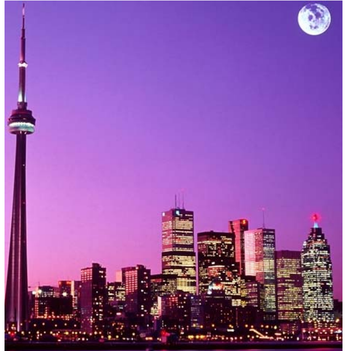
Toronto Skyline, the future home of Firstgold Corp.'s Canadian listing.

Other companies that have taken advantage of dual listings include Barrick, Newmont, and US Gold.